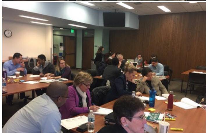
Saint Paul Public Schools educators work collaboratively during a professional development session.