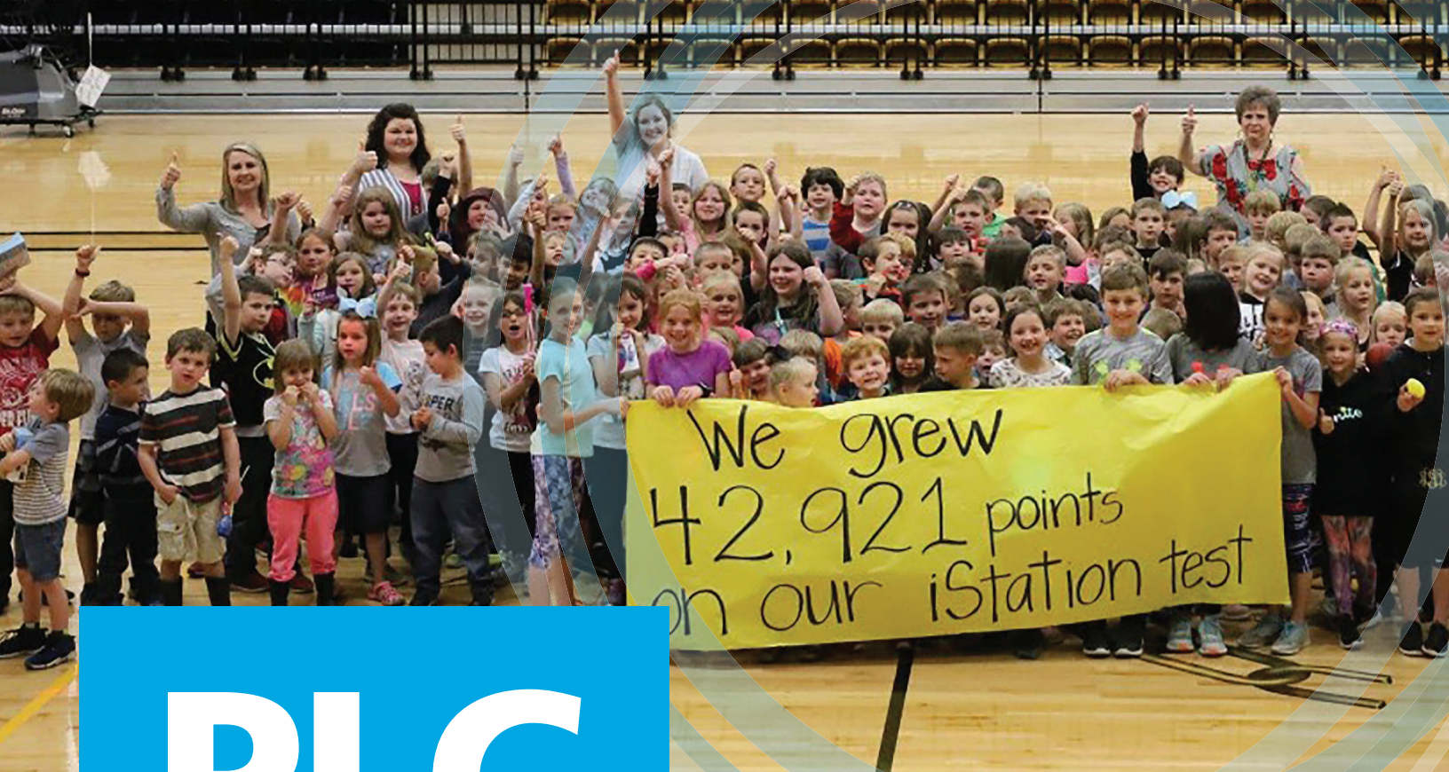
Quitman school students