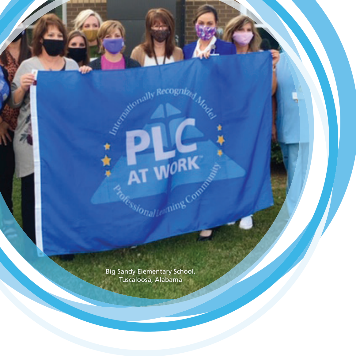
Big Sandy Elementary School, Tuscaloosa, Alabama