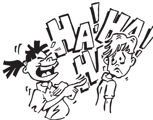
Teasing someone or calling them names