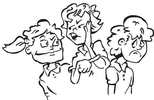
Saying mean things about someone