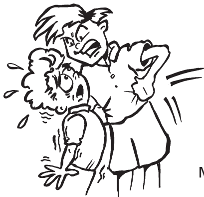
Making someone feel scared